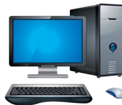
4 PC-Software DigiControl