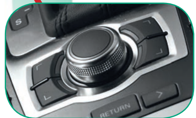
Rotary switch haptics